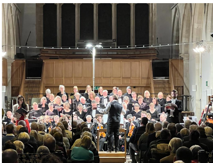
Bach's Christmas Oratorio , November 2023

The [choir] started as it meant to go on, enveloping the exuberant atmosphere and encouraging the audience to come now with gladness, and welcome the morrow. Throughout the performance the joy of Bach's work was etched on the faces of the singers, and this very much carried through in the music of the evening. ('Christmas Oratorio' concert)